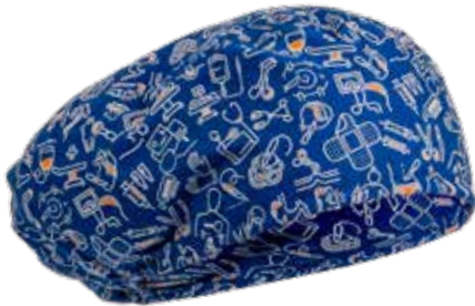
HAT 100%. COTTON 200 G/M 2 GORRO 100%. ALGODÓN 200 G/M 2