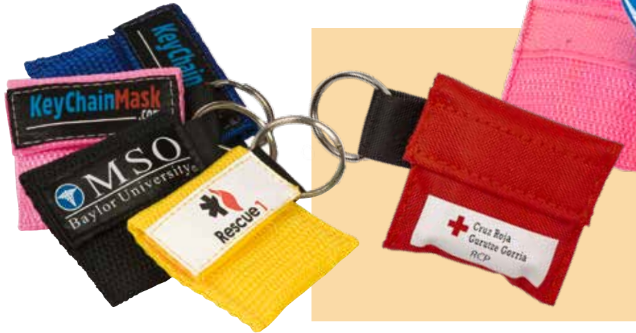
1505 CPR mask. Máscara CPR. MDS: 55x50x15mm