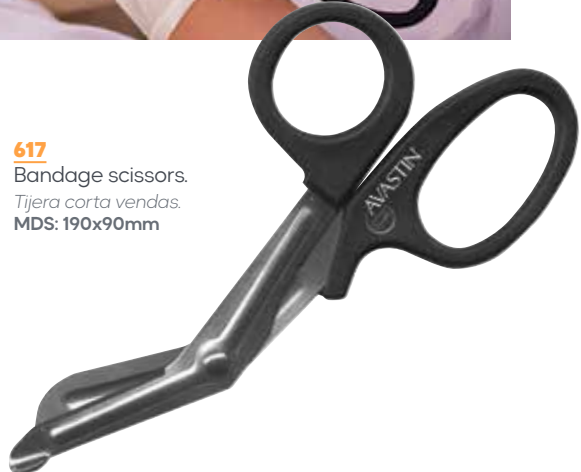
617 Bandage scissors. Tijera corta vendas. MDS: 190x90mm