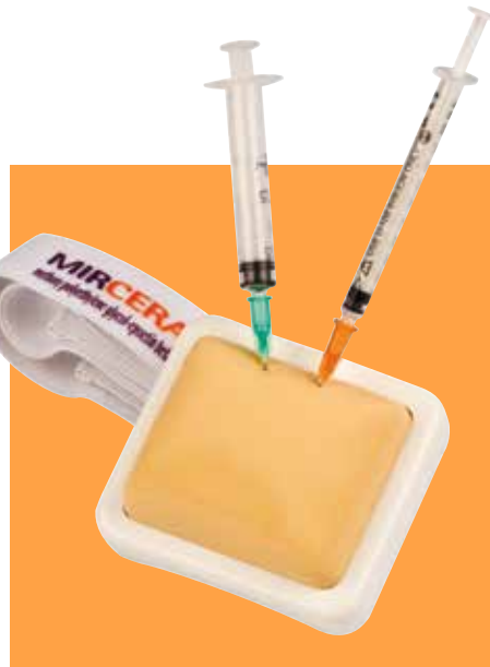
40520 Injection pad for nursing practices. Almohadilla práctica de inyección. MDS: 85x75x34mm