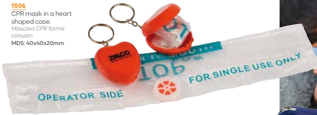
1506 CPR mask in a heart shaped case. Máscara CPR forma corazón. MDS: 40x40x20mm