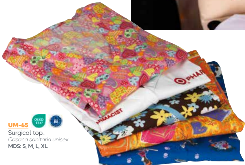
UM-65 Surgical top. Casaca sanitaria unisex MDS: S, M, L, XL